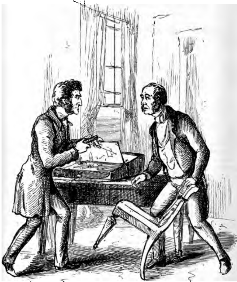
A GOOD SHOT